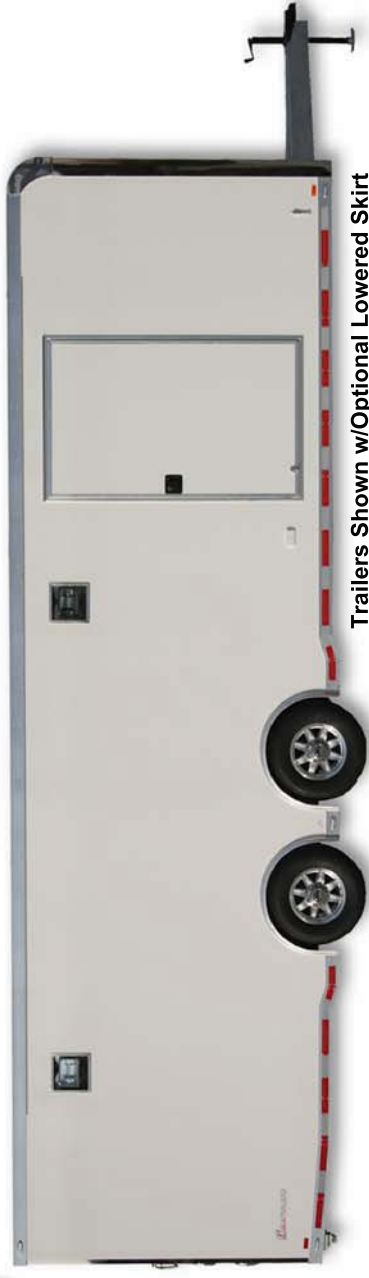
Trailers Shown w/Optional Lowered Skirt and Caster Wheels